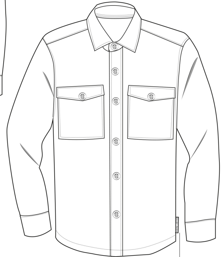
Label on side seam