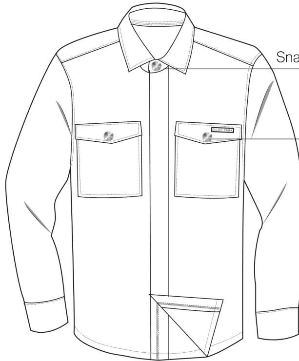
Hidden front placket with front zipper