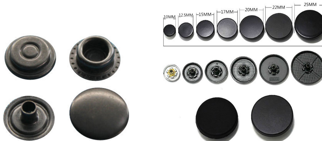
Matte metallic/black snap buttons - 20L - 24L