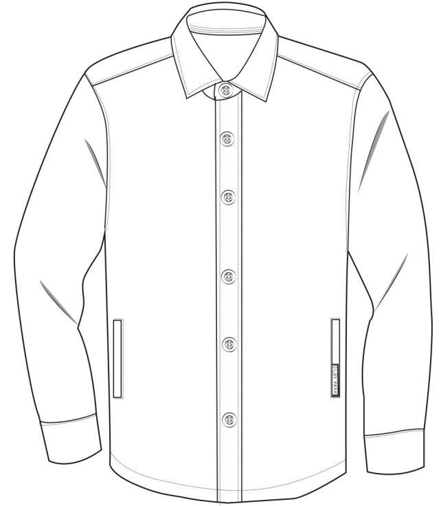
Lower side pockets