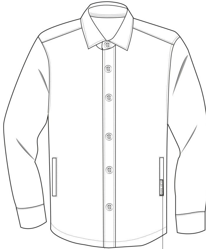
Label on pocket