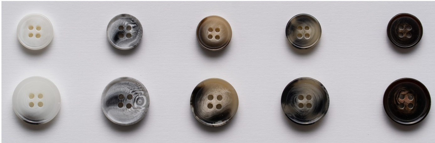
Horn imitation buttons - 24L - 28L