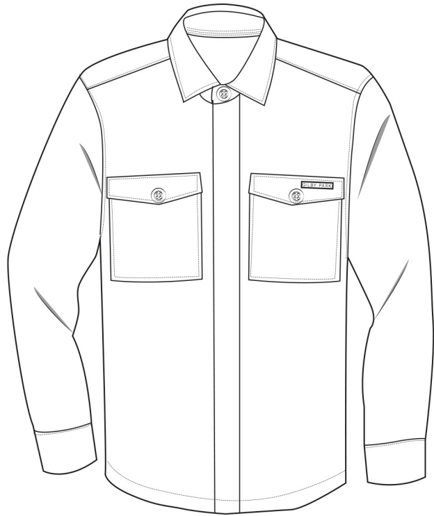
Hidden front placket