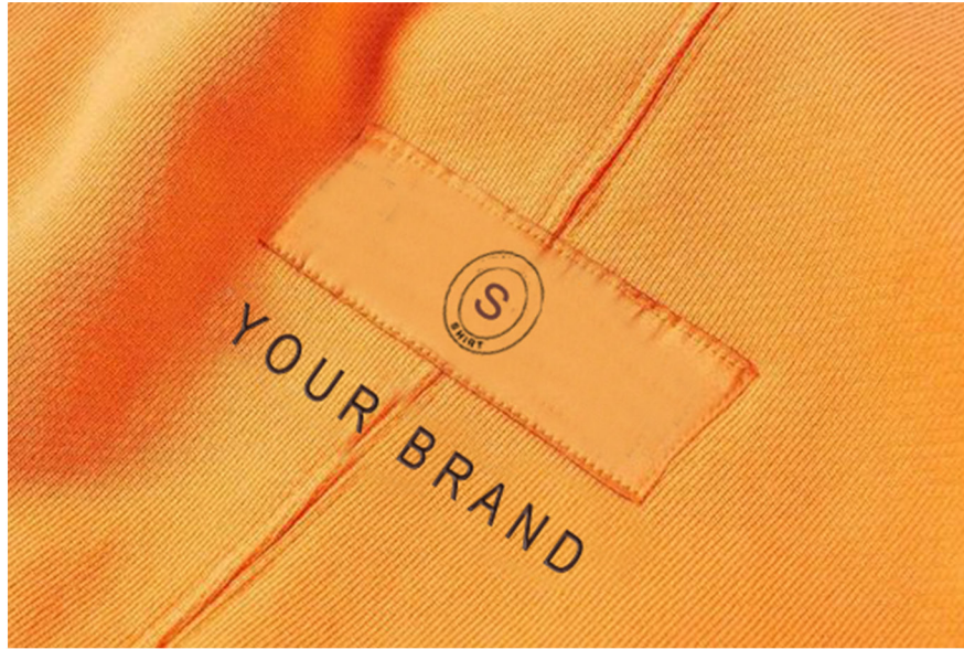
Label on side seam with embroidery